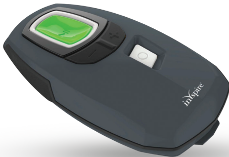
Inspire Sleep Remote Model 2500