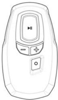
Figure 3. Sleep remote

After you have healed from the surgical procedure, your doctor will adjust your therapy settings so your sleep apnea is treated effectively. You will receive your sleep remote (Figure 3), which allows you to turn therapy on and off. You will also be able to adjust the stimulation strength within a range determined by your doctor.