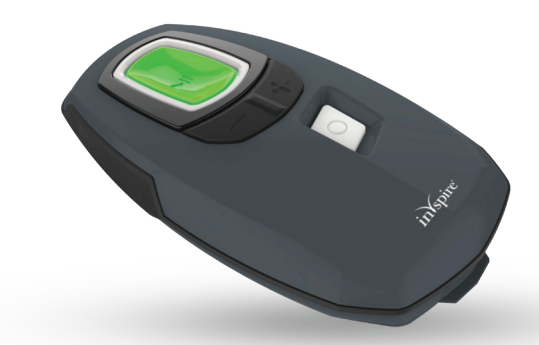
Inspire Sleep Remote Model 2500